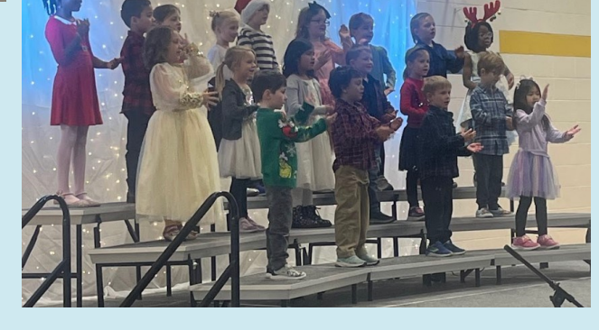
Getting Into the Holiday Spirit